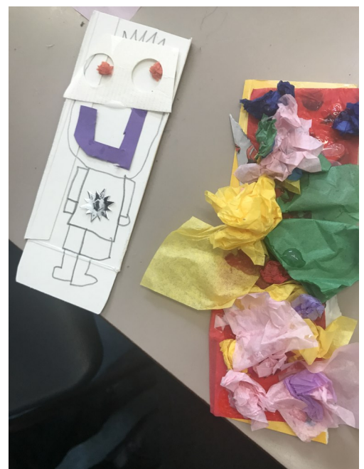
Decorated recycling bookmarks