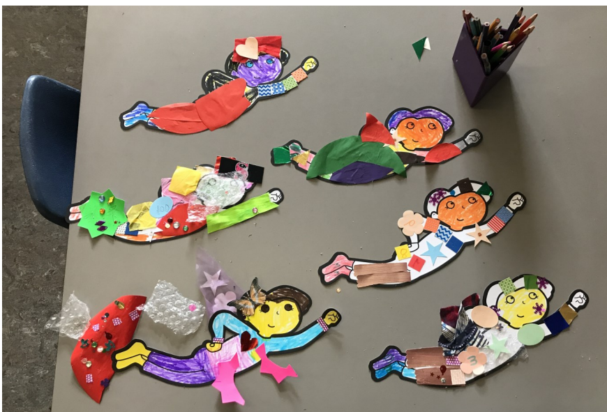
Decorated recycling superheroes

If you have a printer you can print and cut out the recycling superhero on the next page (get an adult to help you). If you don't have a printer you can try and copy it or ask an adult to try and draw/trace it. Or you could make a bookmark instead from a piece of cardboard e.g. an old cereal box.